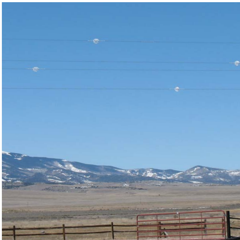
Bird flight diverters